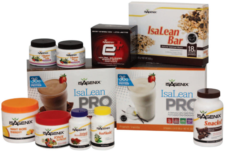
Energy & Performance Pro Pak