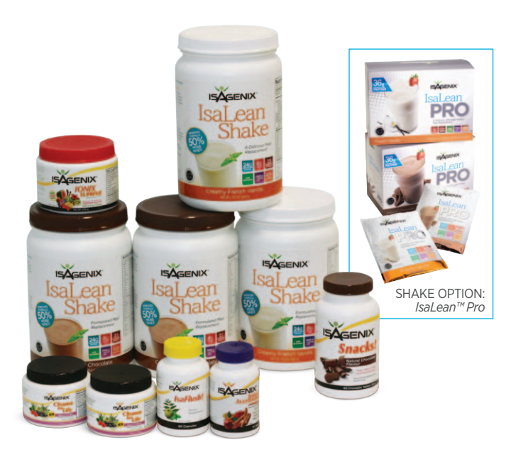
30-Day Nutritional Cleansing Program pictured